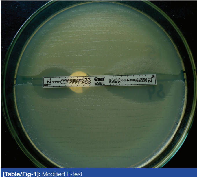
(Tz/Ceftazidime, Tzl/Ceftazidime + Clavulanic Acid)

Confirmation of the ESBLs was done by performing the E-test with a two sided strip which contained ceftazidime on one side and ceftazidime+clavulanic acid on the other side (which was procured from Biomerieux, India). An isolate was considered as an ESBL producer if the ratio of the MIC of the combination to that of ceftazidime alone was \geq 8 or if there was the development of a phantom zone [Table/Fig-1]. We used a modified method in which two strains were simultaneously swabbed on a single plate by dividing the plate into two halves, being separated by a 3mm wide uninoculated area where the E-test strip was placed.